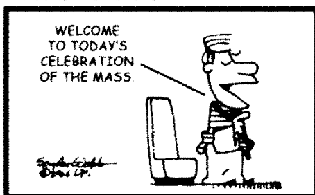
2nd SUNDAY OF EASTER

Missionary: That the risen Christ may be a sign of certain hope for the men and women of the African continent.